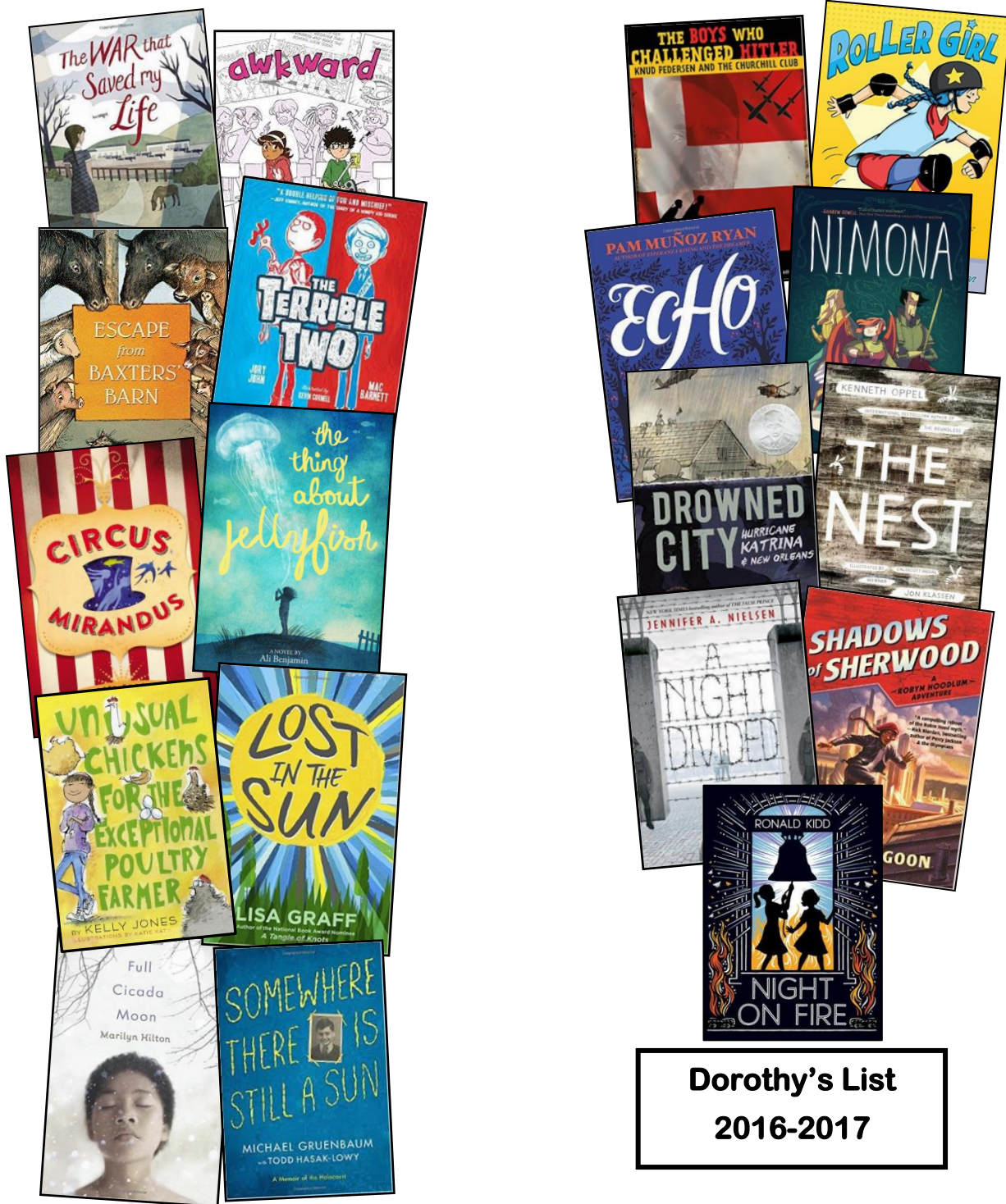
Dorothy's List 2016-2017