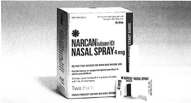
Anti-opioid overdose Narcan Nasal Spray.

./#facebook ./#twitter ./#email ./#print