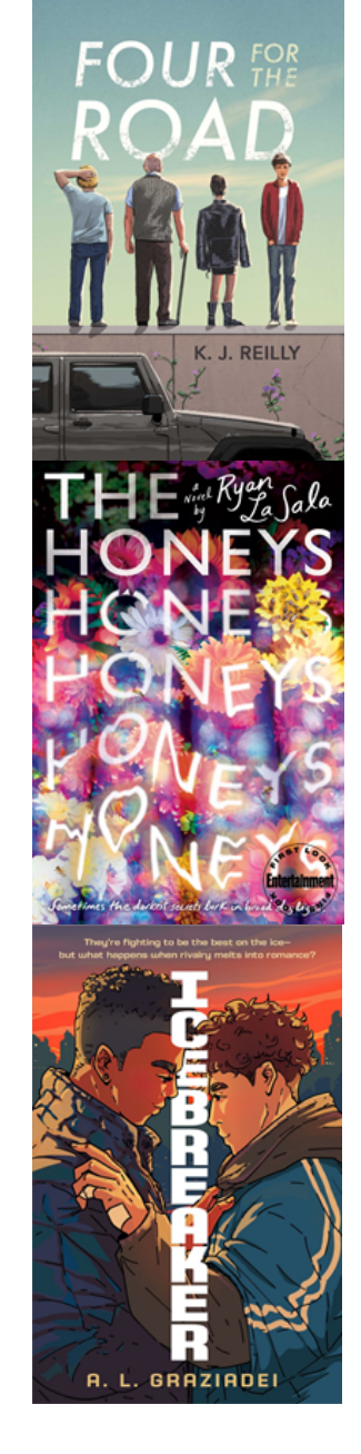
Four for the Road by K.J. Reilly