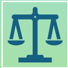
Community Legal Information Center